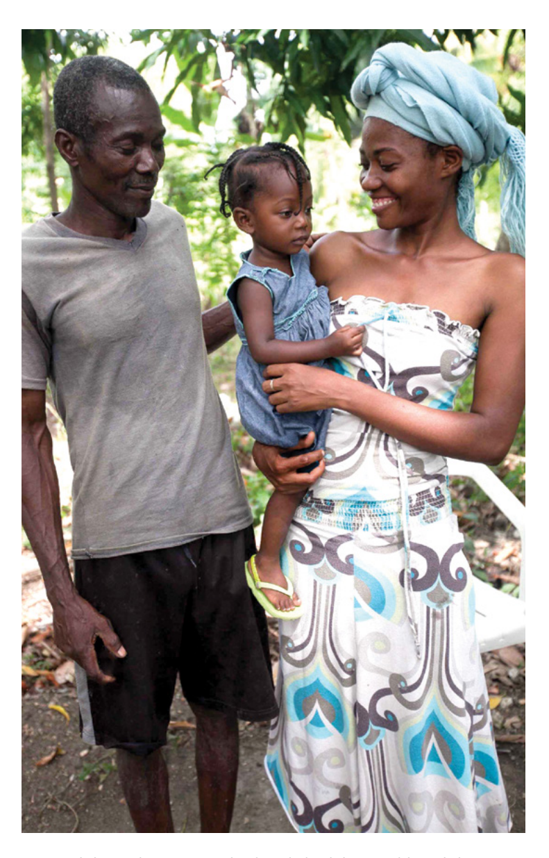
to participate in community-level decision making. It is apparent that for Haiti, the lowest level of male support was for PNC visits<sup>3</sup>.

The SHOW baseline survey in the intervention areas asked about support from male family members during pregnancy, and during and after delivery, in terms of accessing family planning services, and breastfeeding. In the interventions in Haiti, 38.1 percent of adolescent girls, 54.7 percent of adult women, and 37 percent of men reported that the level of support provided to the women had been very good. The percentage of that rating support as very good was lowest for PNC within two days of delivery, as only 11.3 percent of adolescent girls, 14.5 percent of adult women. and 24.8 percent of men confirmed such male support during PNC. For support in accessing family planning methods, 34 percent of adolescent girls, 25.3 percent of adult women, and 37.1 percent of men responded that the male support provided to the women was very good. The numbers supporting women's participation in community and household decision-making, in contrast, were very high, including 94.8 percent of adolescent girls, 95.7 percent of adult women, and 97.9 percent of men. However, 27 percent in Haiti mentioned women's opinions are disregarded as the reason behind women's not getting any opportunity