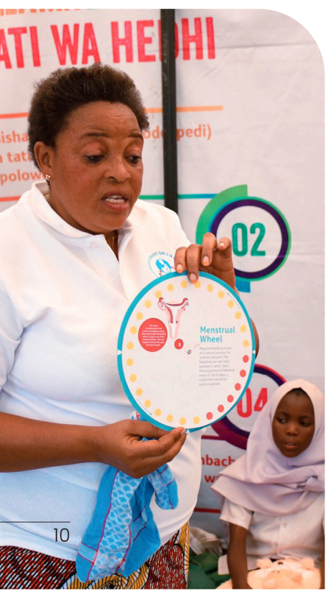
Through menstrual health labs, both girls and boys learn accurate health information, helping break stigmas.