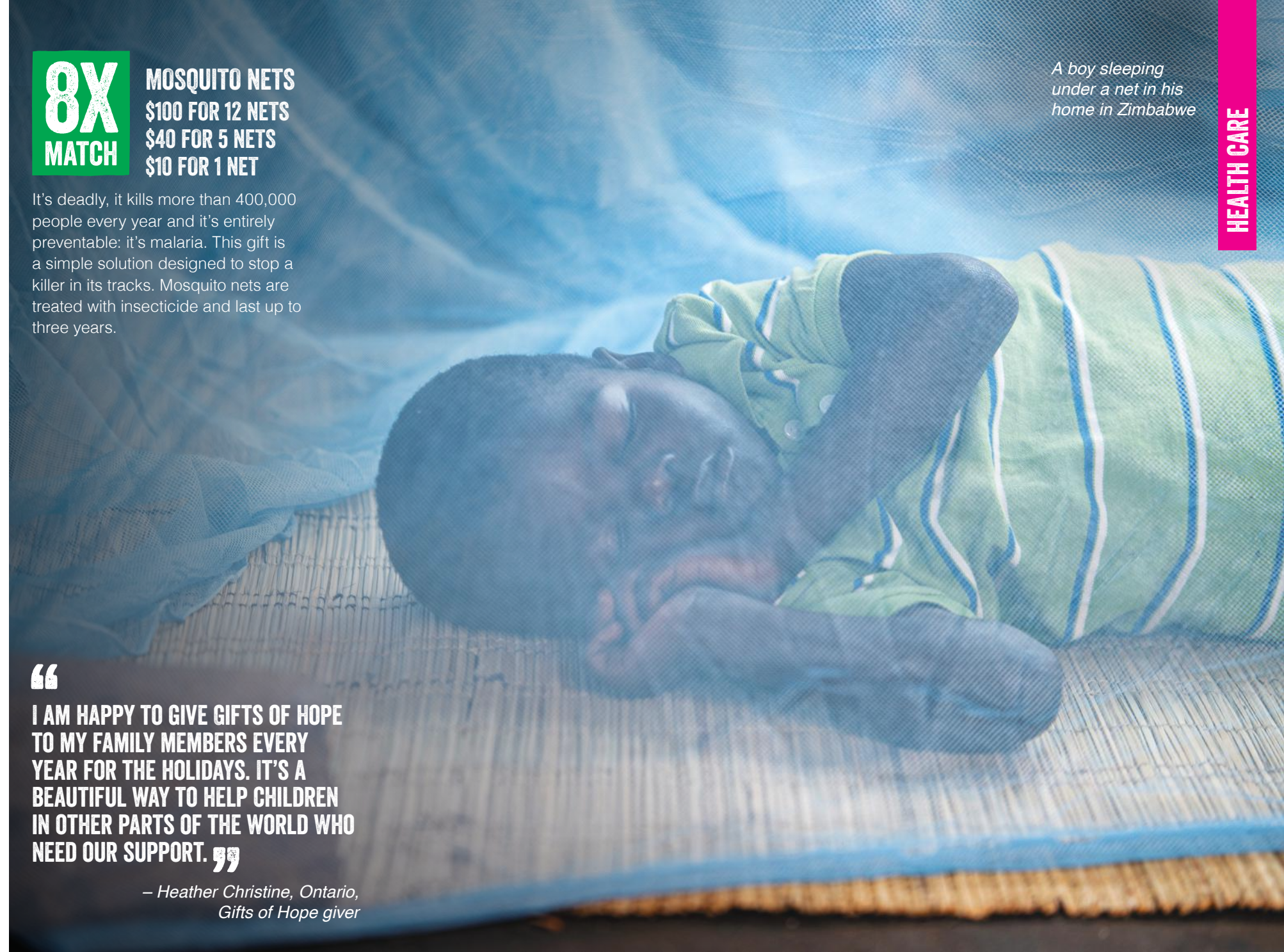
A boy sleeping under a net in his home in Zimbabwe