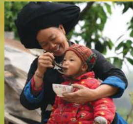
FOOD BASKET $50 Pg 13