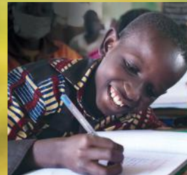
SCHOOL ESSENTIALS $18 Pg 22