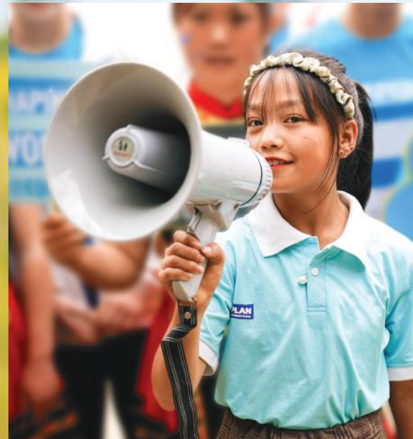
GIRL POWER $100 Pg 24

Every Gift of Hope provides real, tangible items and services that will make a difference in children's lives around the world. Here are some of the most popular gifts that can be especially meaningful for your friends and family.