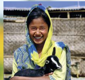
GOATS $80 Pg 17