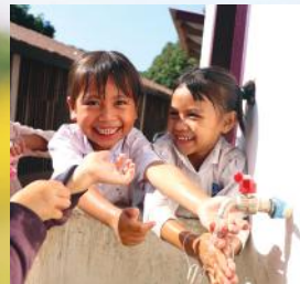
CLEAN WATER FOR FAMILIES $80 Pg 15