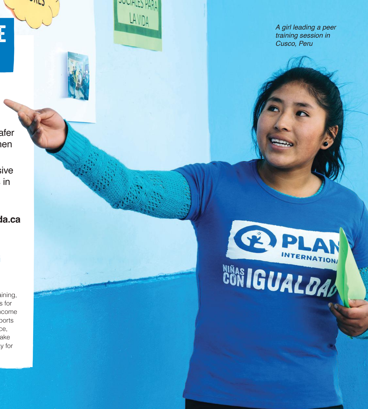
A girl leading a peer training session in Cusco, Peru

Give the gift of leadership training, mentorship and opportunities for girls who live in diverse settings within low-income communities around the world. This gift supports programs that help girls build their confidence, self-esteem and life skills so that they can make their own life choices, thrive and lead the way for the next generation.