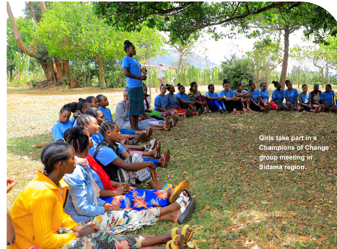
Girls take part in a Champions of Change group meeting in Sidama region.