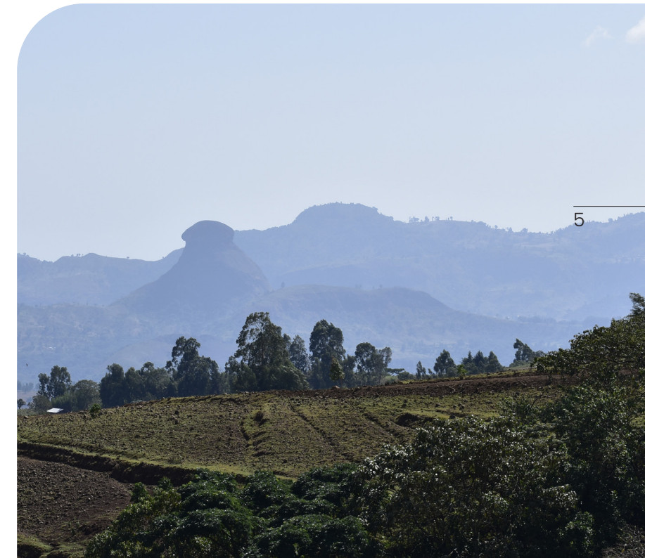
Landscape in Ethiopia's Amhara region

Despite these setbacks, the My Choice for My Life project has been successful at meeting and exceeding its goals. The Ethiopian government has commended Plan International for its work. After visiting a participating health facility, the country's minister of health said that the interventions were the best he had seen among donor projects and that the facility would serve as a model for the rest of the country.