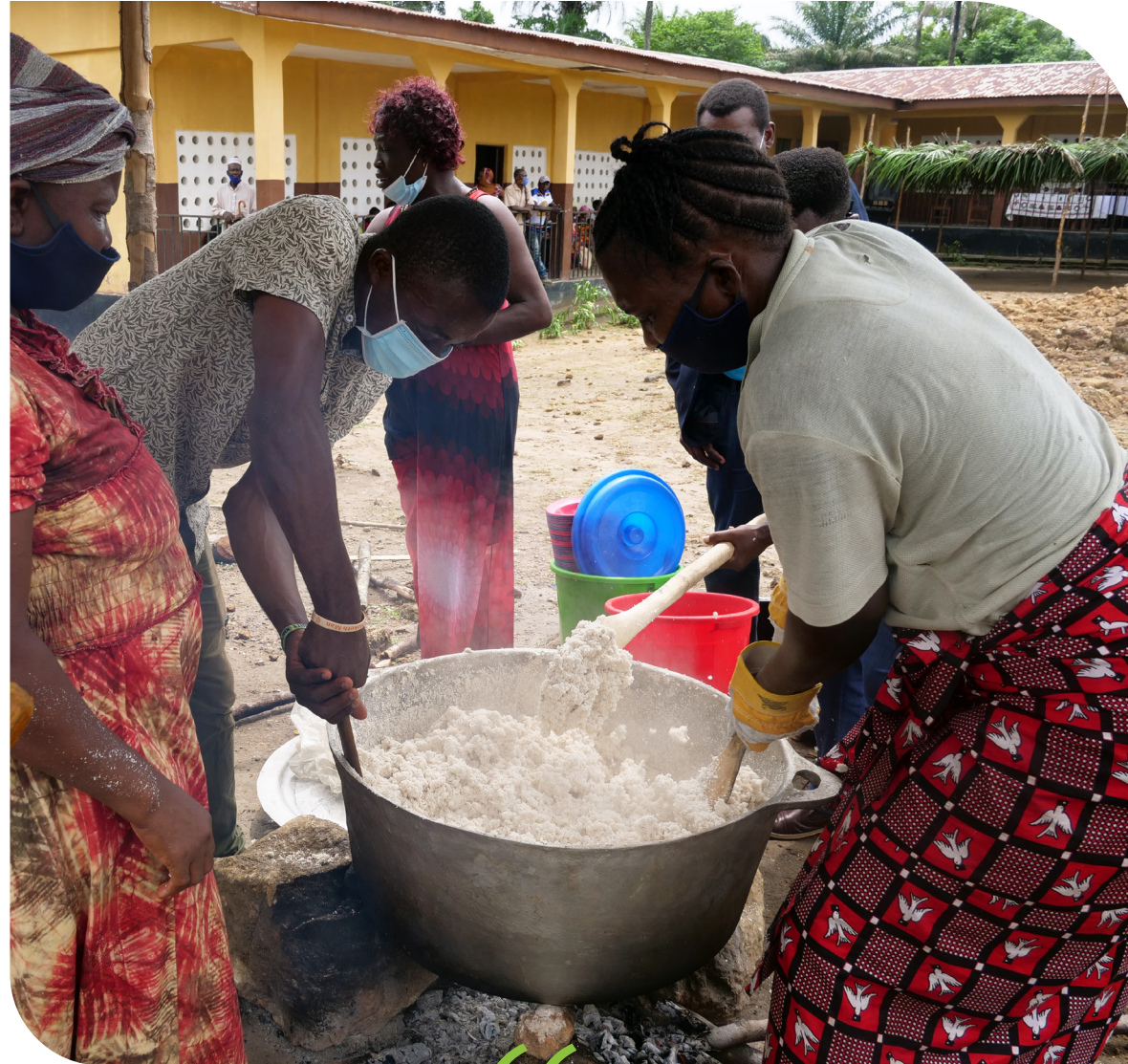
Community spirit in action: Women prepare nutritious meals for the Integrated School Feeding Program.

• We partnered with 1,342 schools across six districts to provide children with the support they need.