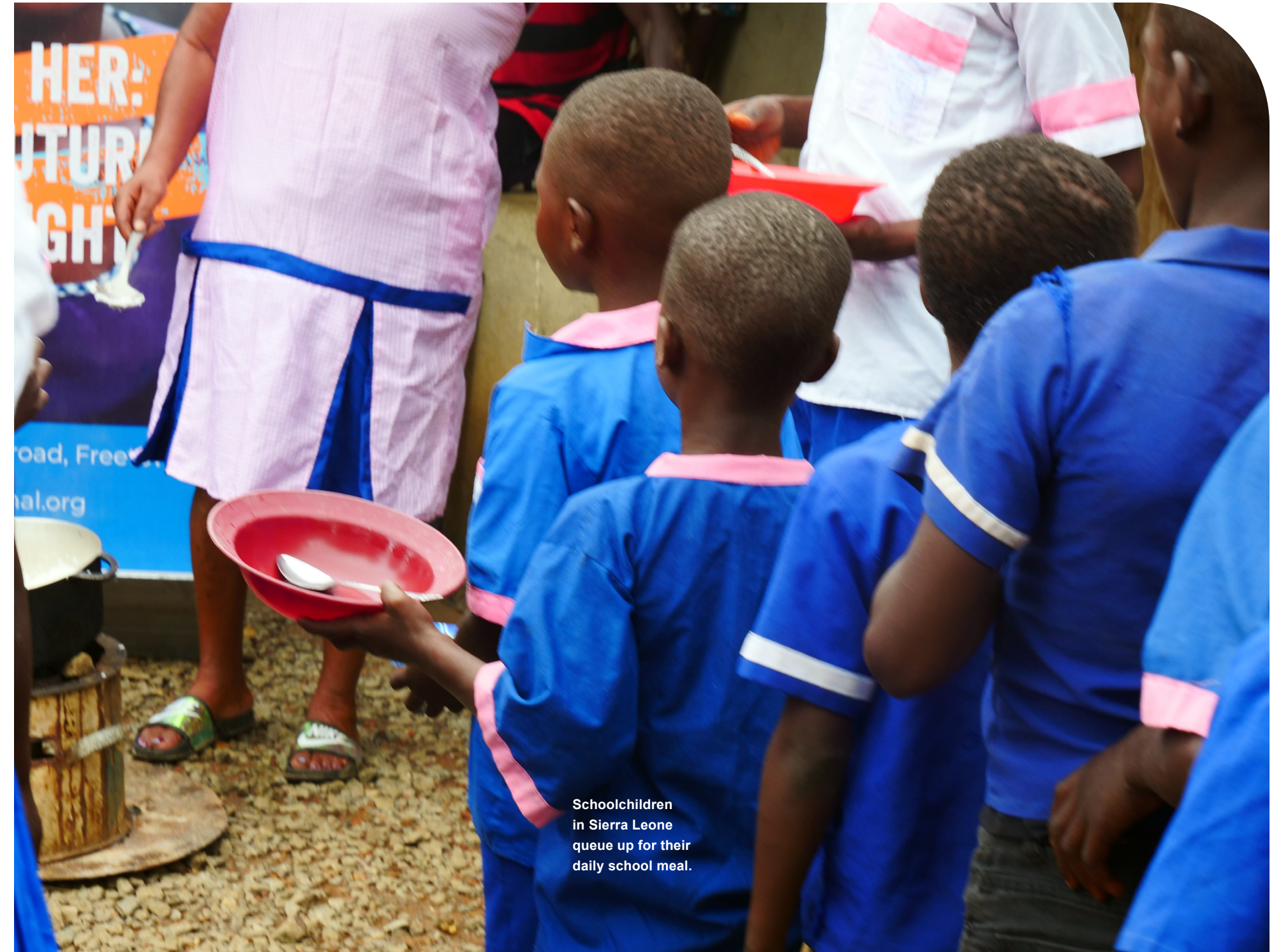
Schoolchildren in Sierra Leone queue up for their daily school meal.