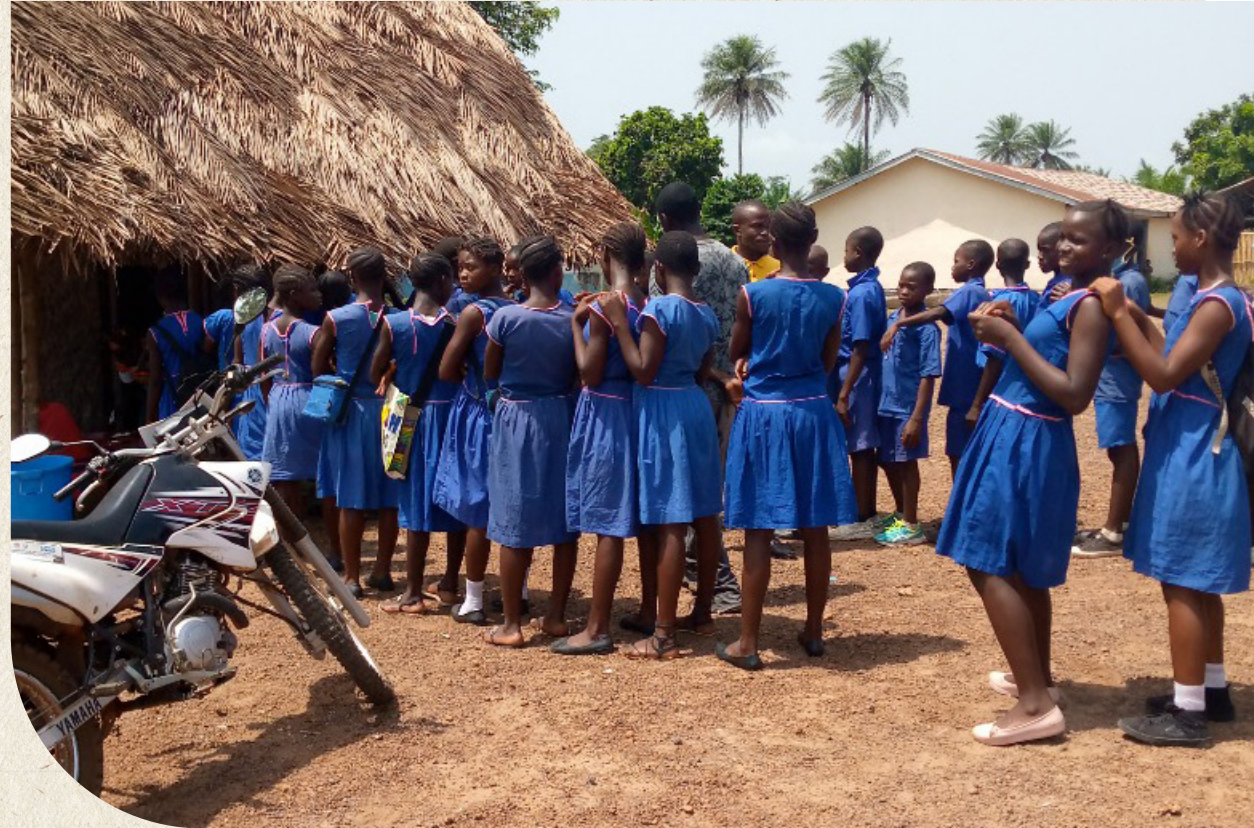
As part of a school feeding program in Sierra Leone, children line up to get their lunch.