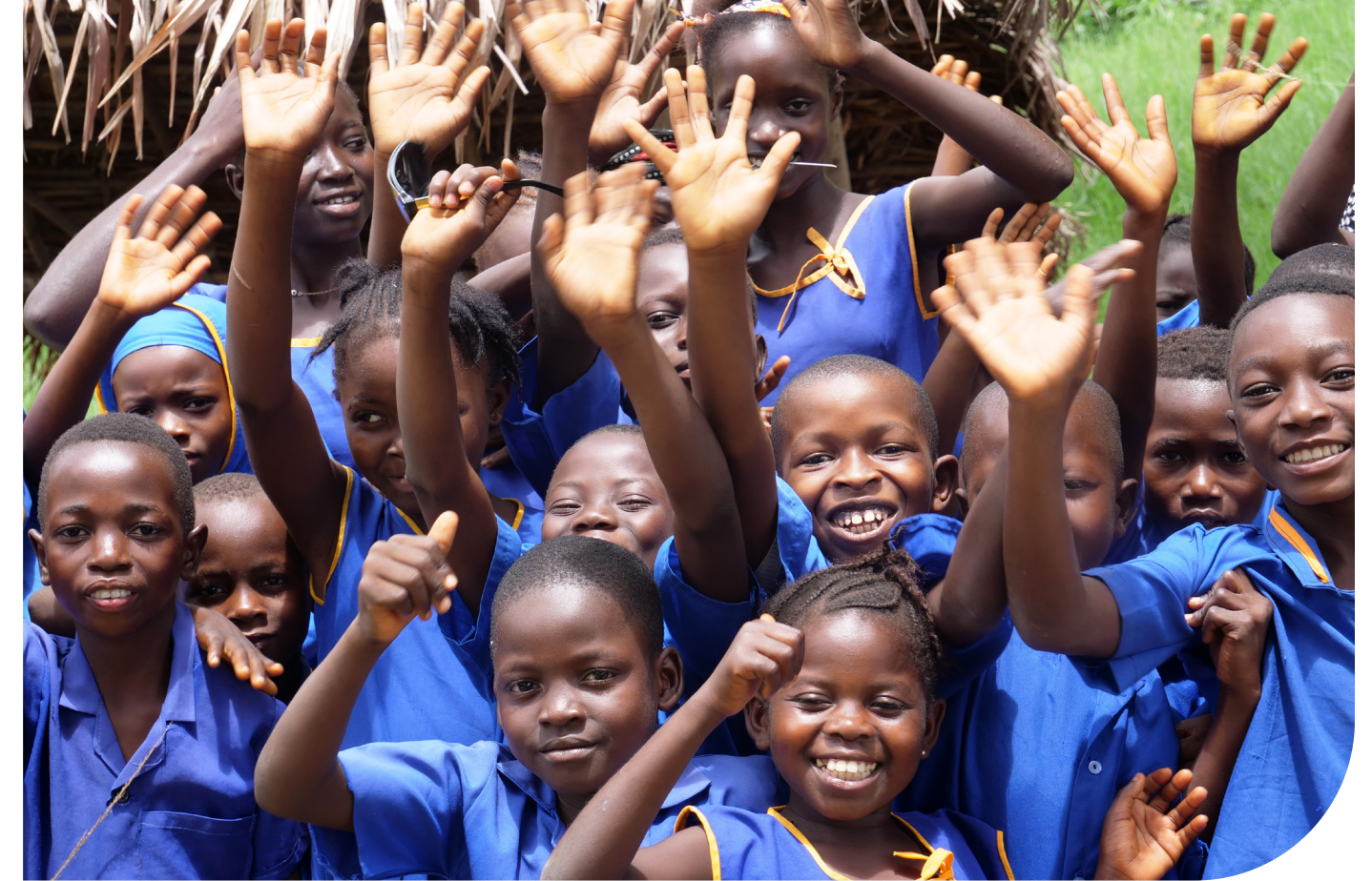
Children at a Sierra Leone school thrive with daily nutritious meals.