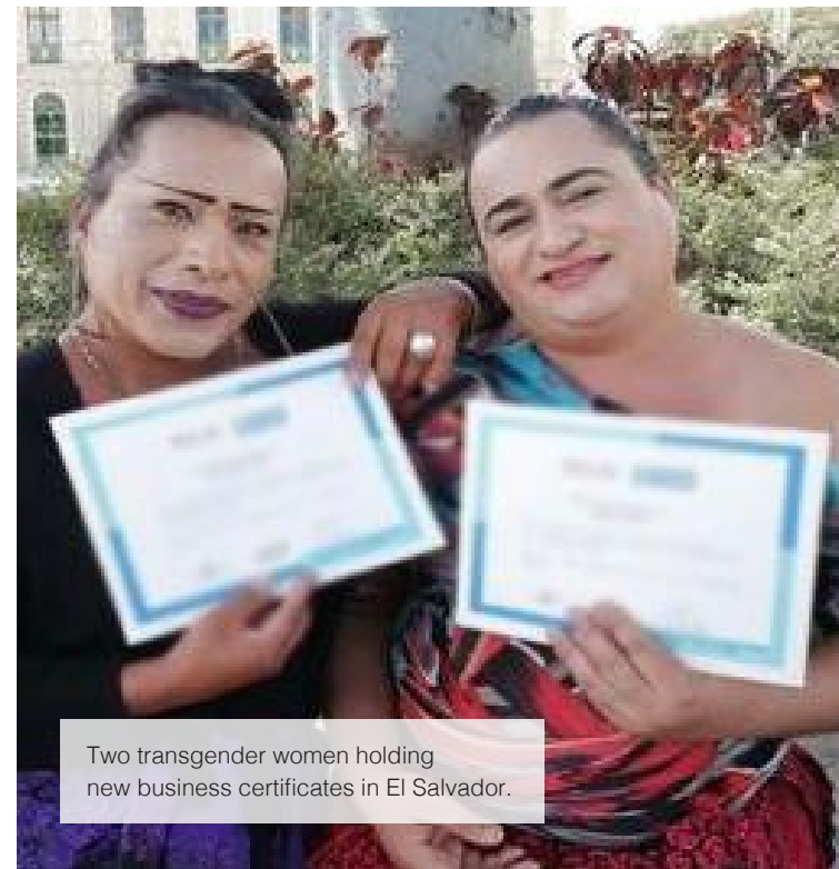
Two transgender women holding new business certificates in El Salvador.

The Because I am a Girl project works in the region and other hunger hotspots to help girls secure food and protect them from being forced to sacrifice their future.