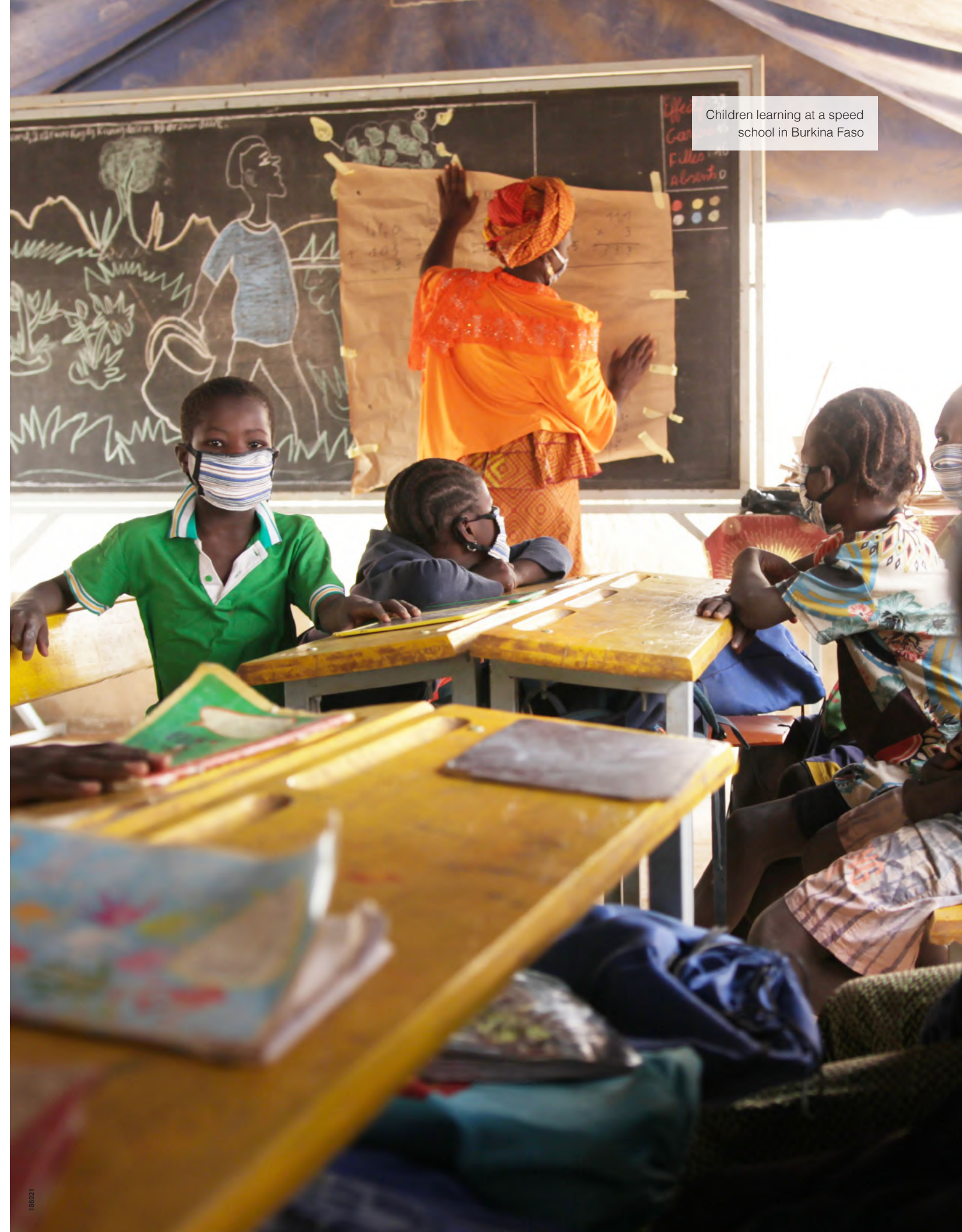
Children learning at a speed school in Burkina Faso

THANK YOU for believing in the power of girls to change their lives and achieve their dreams!