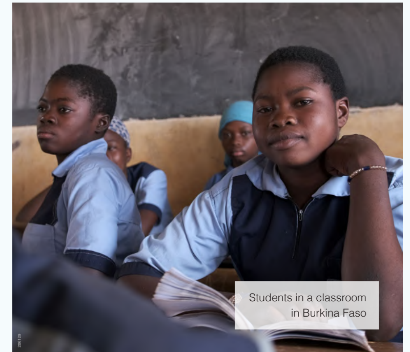
Students in a classroom in Burkina Faso

She always wanted to return to school, but it felt further away as time passed. Imagine overcoming child labour, child marriage and terrorism only to run into one more hurdle: reintegrating into the formal school system after five years away from it.