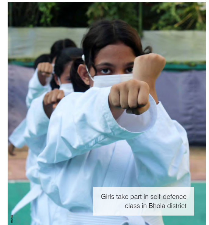
Girls take part in self-defence class in Bhola district

The bonus? "For a long time, I wished to learn self-defence techniques," she says. "Learning karate in this project, I became more confident than ever before." Take that!