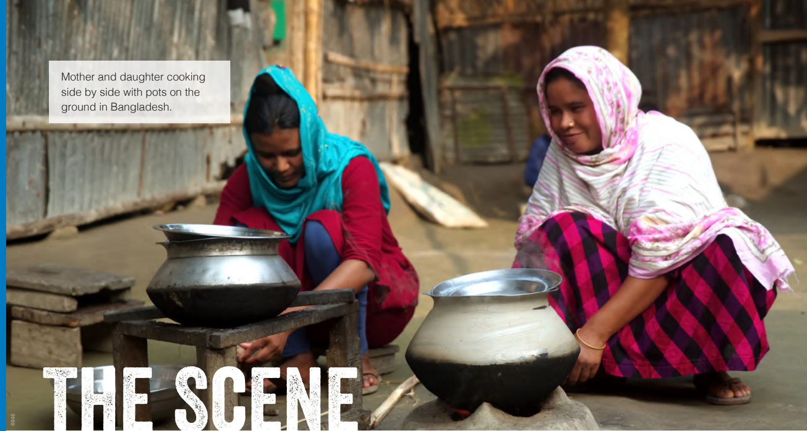
Mother and daughter cooking side by side with pots on the ground in Bangladesh.