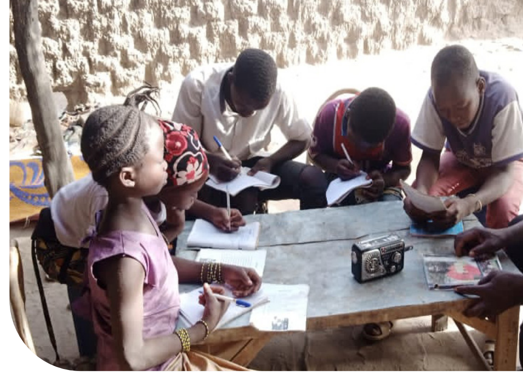
Children listen to pre-recorded lessons on radios provided by Plan International.

"To support home learning, we provide radios with pre-recorded materials for children to access with community