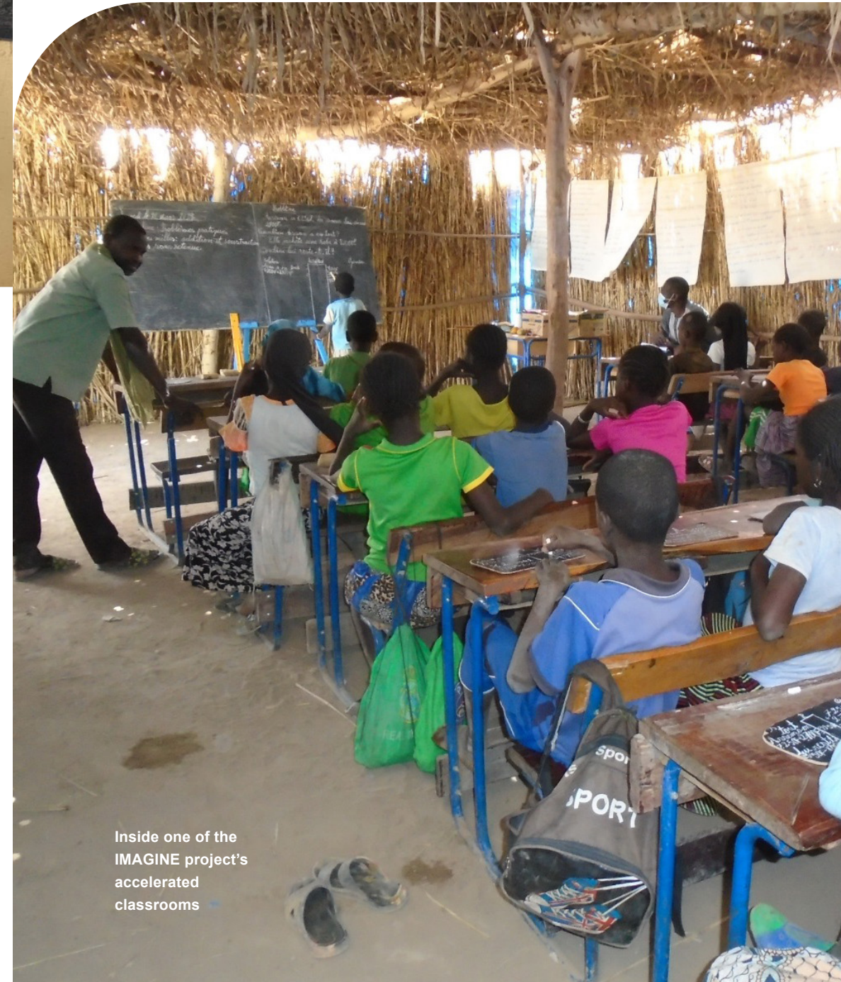
Inside one of the IMAGINE project's accelerated classrooms

– Irihan, student and IMAGINE project participant