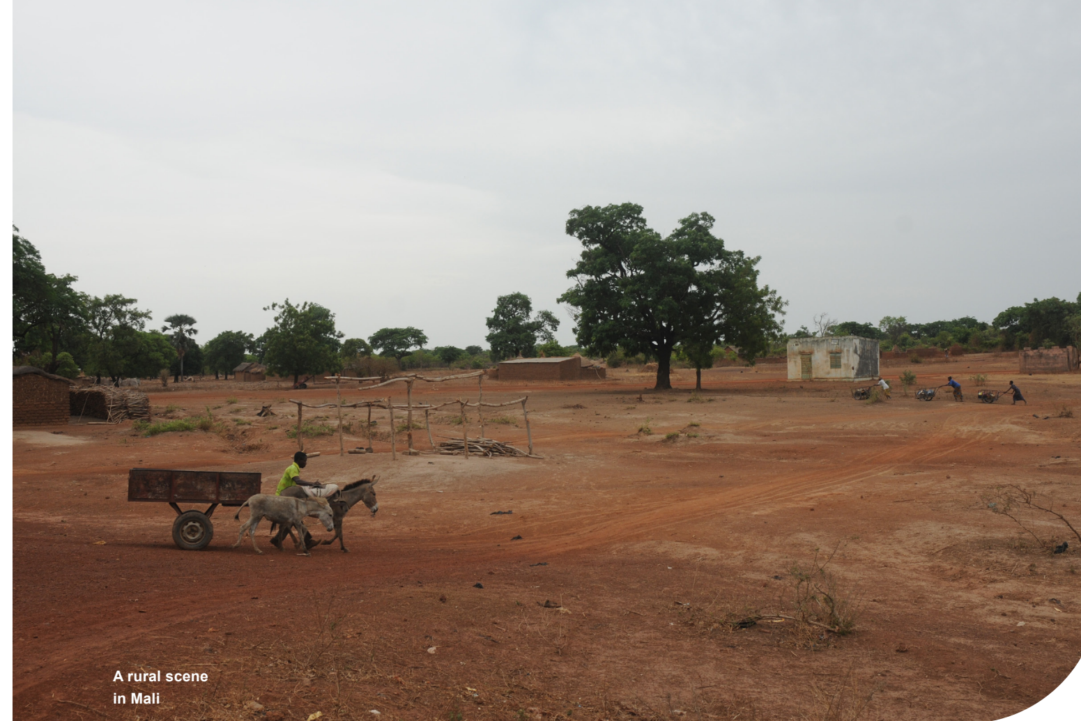
A rural scene in Mali

The IMAGINE project has devised informal strategies to keep children, especially girls, educated despite these impossible circumstances. In areas where schools are reopening, project staff implement what is called “accelerated education”: When children are years behind in their education due to prolonged absences, they need to catch up before they can rejoin class. The accelerated