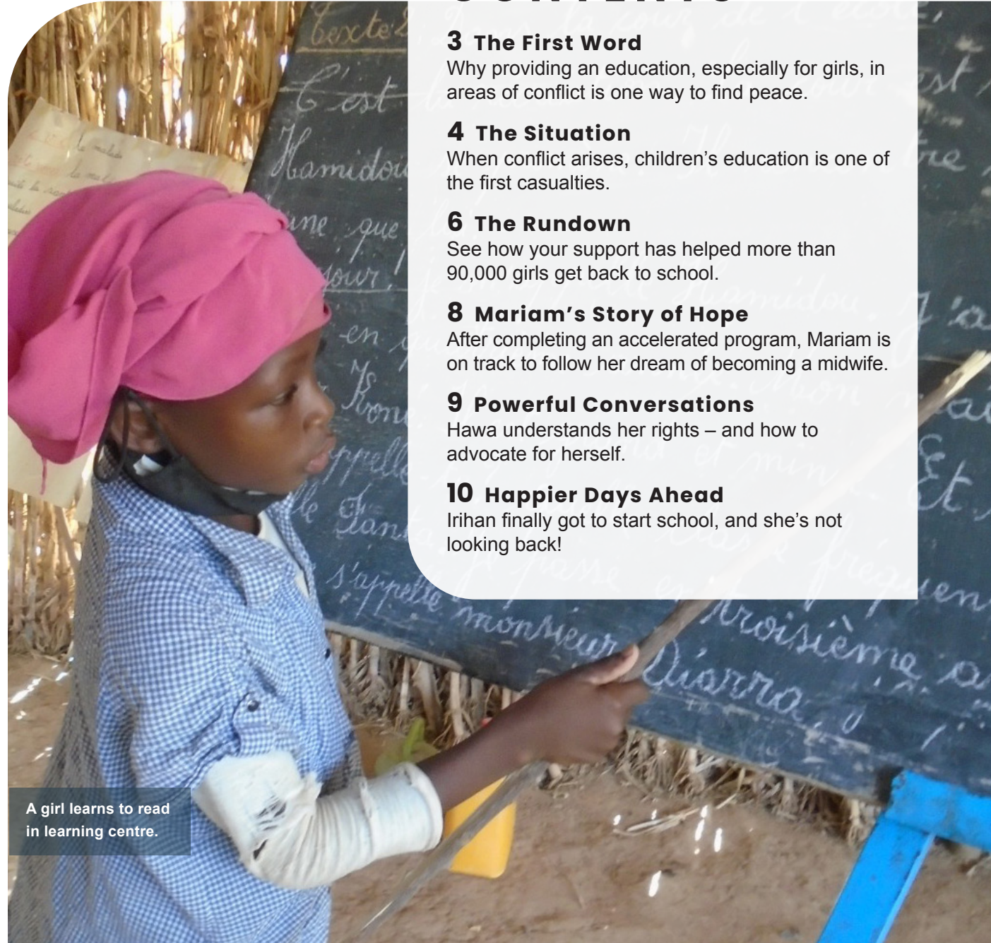
A girl learns to read in learning centre.

WHO: IMAGINE is a joint project with World Vision and Save the Children and is funded by Global Affairs Canada and individual Canadian supporters.