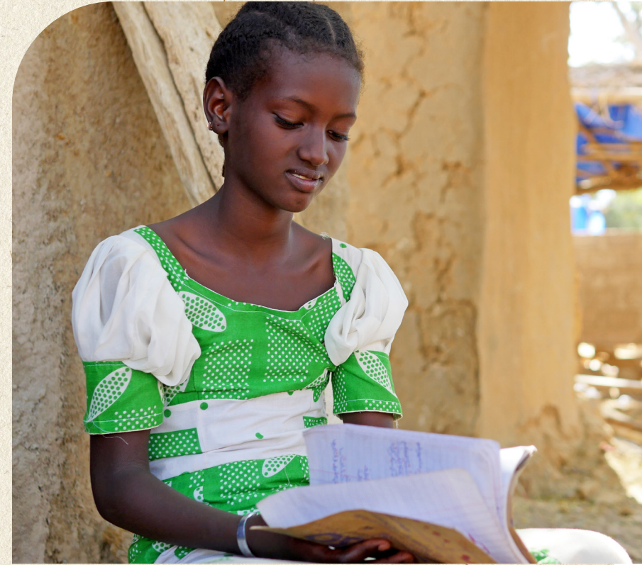
Above: One of the young girls who is now back in school. Left: An outdoor informal class where children get a chance to reboot their learning.