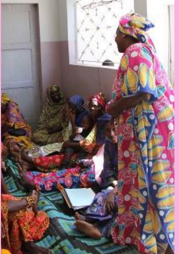
Members of grandmothers groups in Kaolack and Pikine