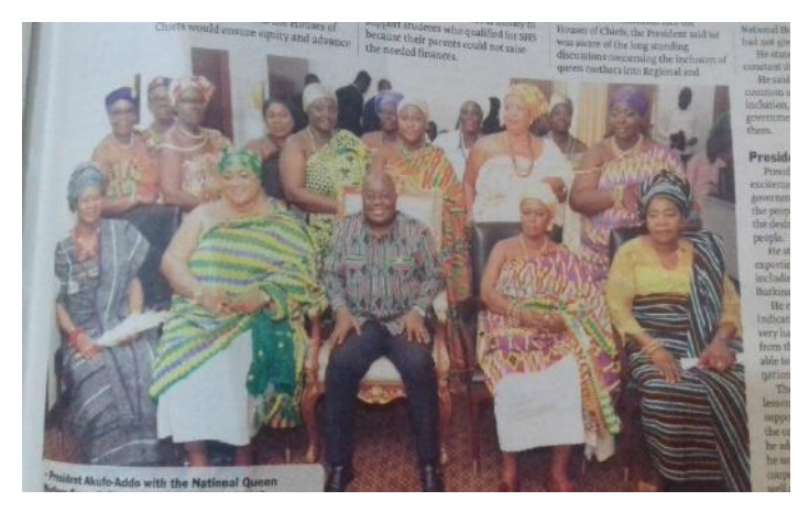
A photo of Queen Mothers National Association Members and the Ghanaian President from a local newspaper

While the engagement with Queen Mothers and Magajias has been consistent and successful by SHOW in Ghana, the project could better engage with the National Association for Queen Mothers. Doing so, would allow for systematic and larger reach and more sustainability by leveraging the power of female leaders institutionally.