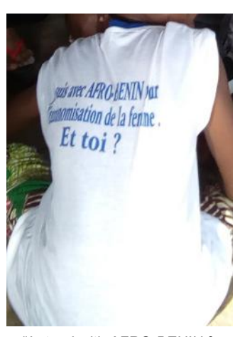
"I stand with AFRO-BENIN for women's empowerment. DO YOU?"

tivities implemented by AFRO -BENIN underlines the positive impact on her and her eagerness to continue being involved: "I really appreciate AFRO-BENIN's activities. It is thanks to them that I was able to know my HIV status (...) I participate in the activities and it is very helpful (...) We can have a better understanding and explanations on sexual orientation and our rights. I would really like to participate in these activities over and over again and learn more".